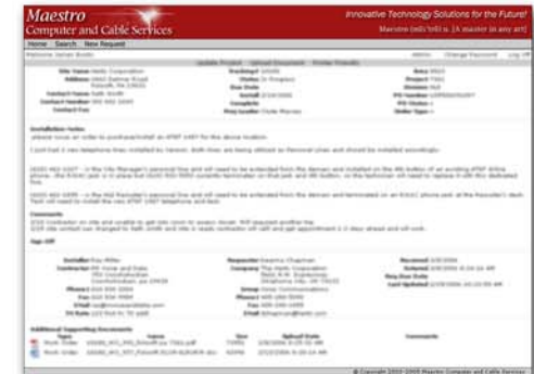
Our real-time FastTrack project tracking system.

We will do the leg work to get all local approvals needed to do the job.